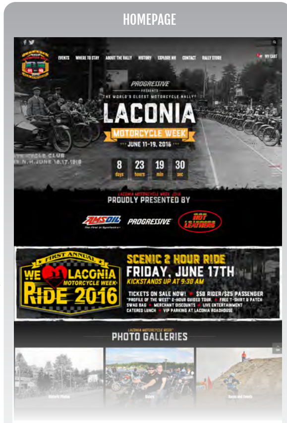
HOMEPAGE MIDDLE BANNER 1500 x 420

By Channel – Traffic Increases Direct 40% / Referral 67% / Social 144% / Email 675%