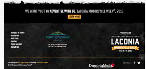
FOOTER on every page 230 x 175